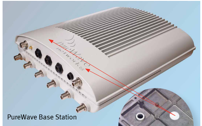
PureWave Base Station