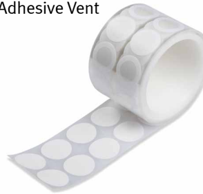
GORE® Protective Vents Adhesive Vent