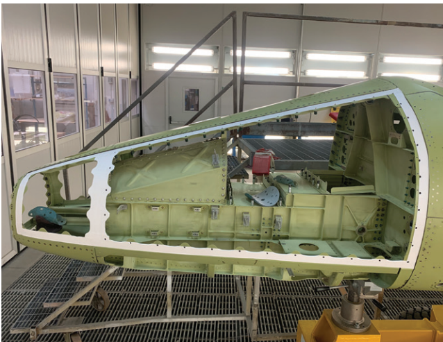
Figure 1: GORE® SKYFLEX® Aerospace Tapes, 700 Series installed on the front fuselage.

In addition, Gore’s 700 Series is more durable and robust to reliably protect against corrosion and chafing on the windshield and fuselage panels whenever they are periodically opened and closed. The lower-density construction of Gore’s dry tape used to seal the 42 panels weighs only 0.84 kilograms (kg) in comparison to the estimated quantity of polysyllable wet sealant used for the same area that weighs 1.9 kg. Therefore, Leonardo can save approximately 50% in weight using Gore’s 700 Series, which translates to more payload on the M-345.