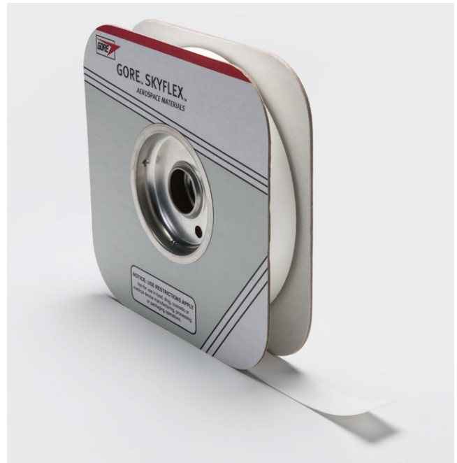
GORE® SKYFLEX® Aerospace Tapes, 700 Series

This document is for informational purposes only and not a substitute for published technical data. For more information regarding GORE® SKYFLEX® Aerospace Materials, visit gore.com/skyflex .