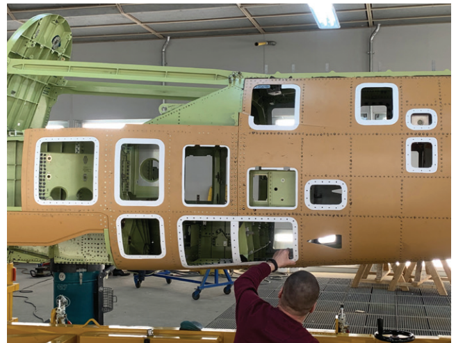
Figure 2: GORE® SKYFLEX® Aerospace Tapes, 700 Series installed on the center fuselage.